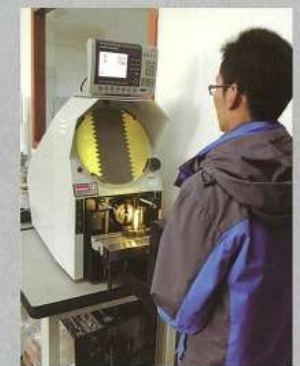
光學投影機 Optical Projector