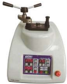
鑲埋機 Mounting Press