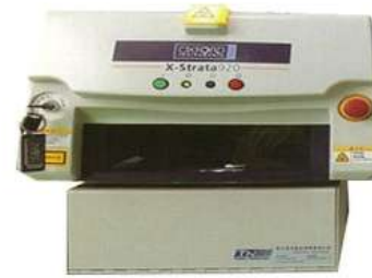
X 射線螢光測厚儀 XRF for Coating Thickness Measurement