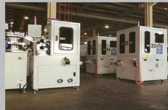
影像自動篩選機 Optical Sorting Machine