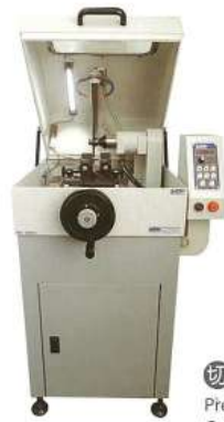
切割機 Precision Abrasive Cutting Machine