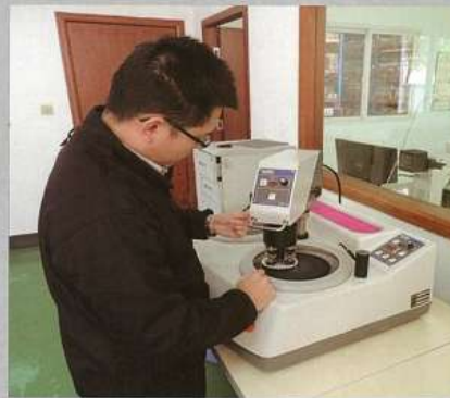
研磨拋光機 Grinding & Polishing Machine