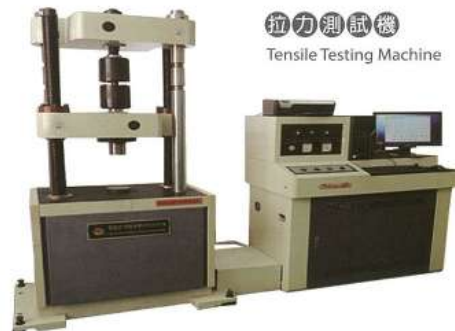
拉力測試機 Tensile Testing Machine