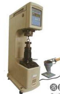
洛氏硬度試驗機 Rockwell Hardness Tester