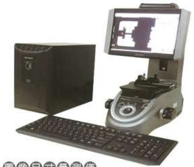
圖像尺寸量測儀 Vision Measuring Instrument