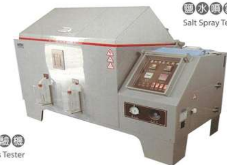
鹽水噴霧試驗機 Salt Spray Tester