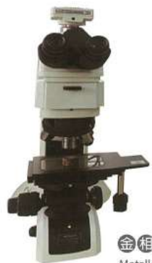
金相顯微鏡 Metallographic Microscope